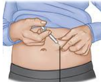
Pinch and inject