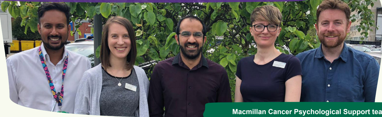
Macmillan Cancer Psychological Support team

The Macmillan Information and Support Centre's Health and Wellbeing Day took place in May, and was a day of practical insights for cancer patients, their relatives and others affected by cancer.