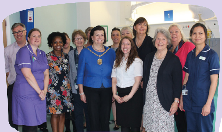
Representatives of the Macmillan Merton Committee, the Mayor of Merton, and members of our cancer team

The Mayor of Merton said at the visit: "Thanks to Macmillan Merton these vital funds have been raised in a record amount of time. It is truly wonderful that their hard work and dedication has enabled this valuable unit to exist and continue."