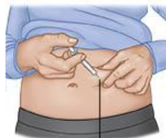
Pinch and inject