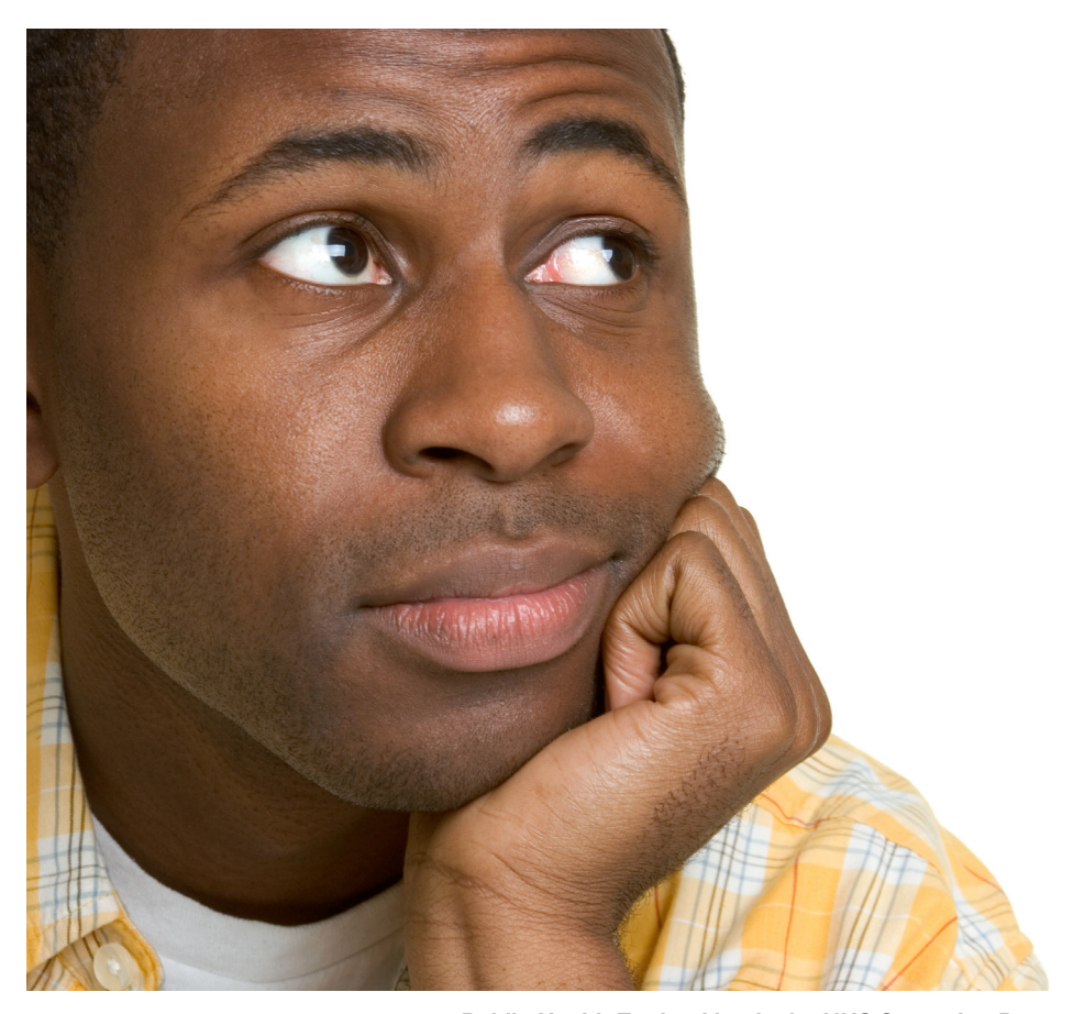
Public Health England leads the NHS Screening Programmes

Information for fathers invited for a screening test for sickle cell disease and thalassaemia major