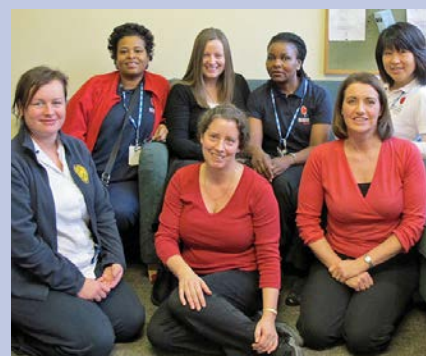
TEAM WORK: The respiratory team are improving care for their COPD patients

The project began with the team mapping out patient journeys from the time patients came into A&E, through to their discharge. This process identified gaps and bottlenecks which needed addressing. As a result the inpatients respiratory nurse service has been redesigned and patients are now seen by the respiratory nurse earlier in the admission process. Patients are reviewed, assessed and issued with a COPD discharge pack, all patients on discharge are referred to the community respiratory team for follow up within 24 hours and closer working relationships with the acute medicine unit, geriatrics and respiratory ward have been developed.